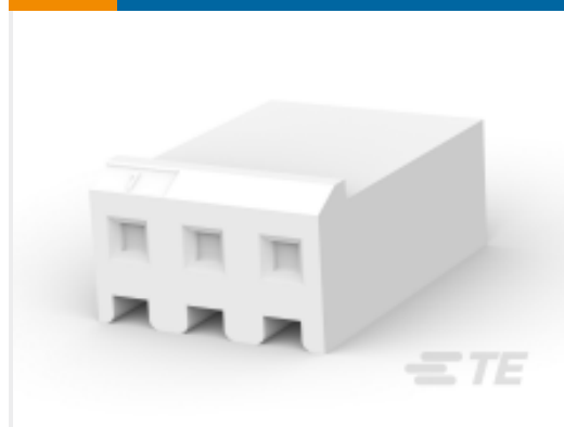
TE Part # CAT-103156-WBHSM Receptacle Housing: Wire-to-Board, with Mating Alignment, SL156