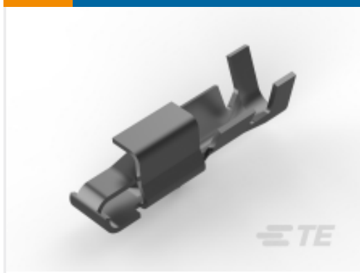
TE Part # CAT-103156-WTBCC Wire-to-Board Connector Contacts: socket, wire size 30-16 AWG, SL 156